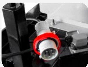
Power cable with aerial plug CEE16A/5P or CEE32A/5P.