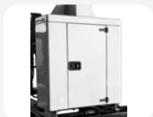
Cabinet to store the lights during transport.