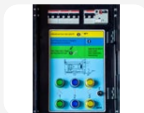
Control and protection panel.