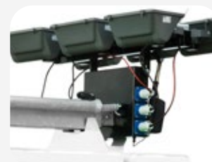
Connection box for easy set up and disassembling of the lights.