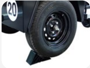
Wheels with P175/80 R13 tyres and safety wedge.