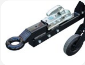
Towing bar with dual hitch: ball and ring.