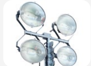
4 metal halide lights 1.000 W each.