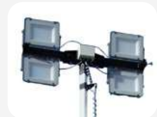
4 LED spotlights x150 W