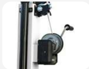
Manual raising system